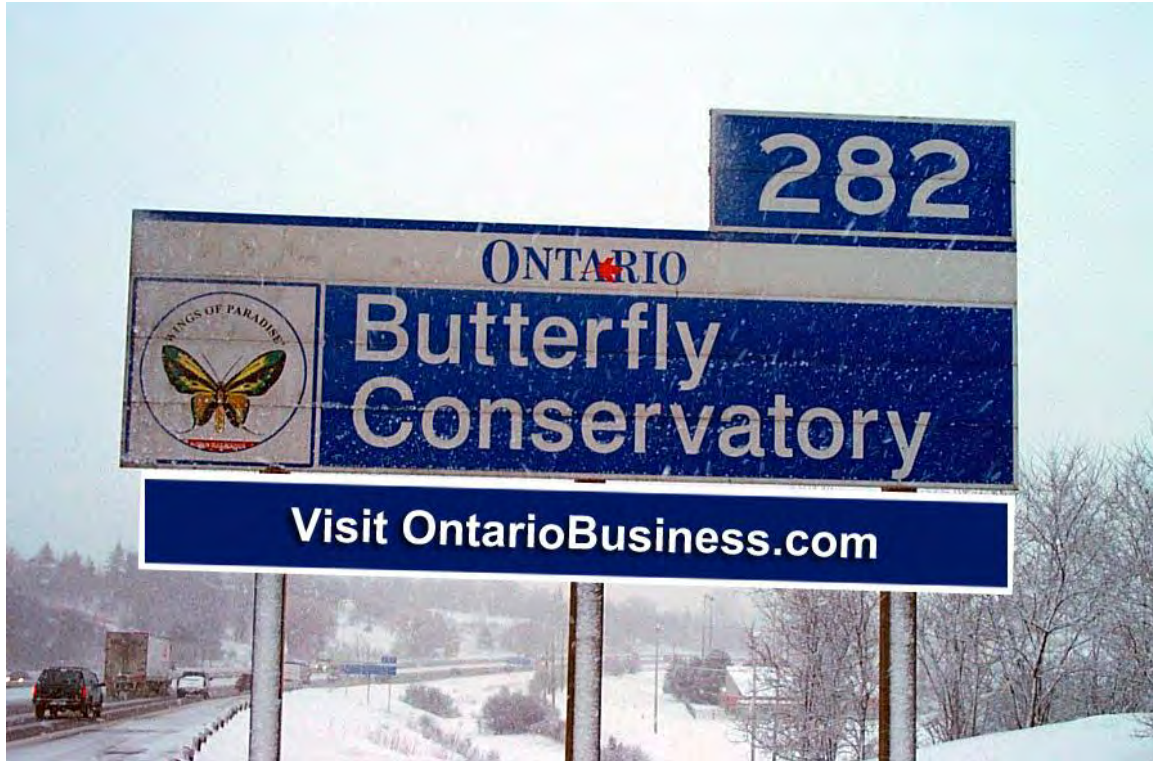
Photo Examples for OntarioBusiness.com/.ca Proposal